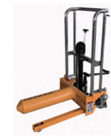
Option-Polar with bearing