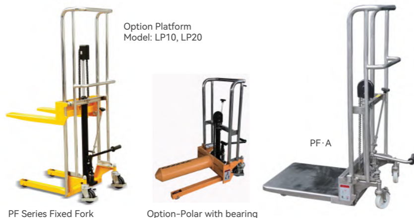
PF Series Fixed Fork